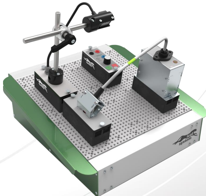
Sample application of a complete test station for checking a colored protective coating

For instance, it is possible to check the color, arrangement and order of cables without requiring extensive setup.