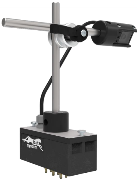
Example of iCATsystem vision with test box module

A smart monitoring system of the iCATsystem product family for optical testing tasks.